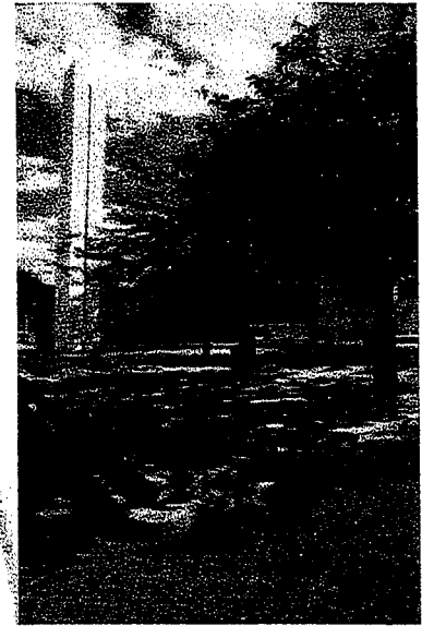
Millenium Spaces, Glasgow