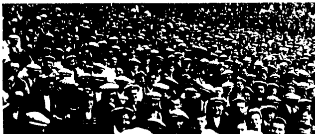
Buckhaven demonstration during the National Strike, 1926.