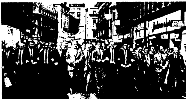
Upper Clyde Shipbuilders march, Glasgow 1971.