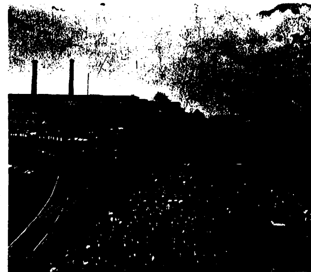
Workers leave Singer's factory at Clydebank, 1900 -1914.

the history of working people in Scotland would be encouraged or arranged.