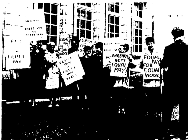
Equal Pay lobby at the Scottish Trades Union Congress.