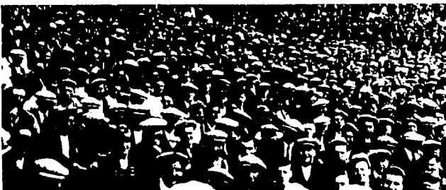
Buckhaven demonstration during the National Strike, 1926.