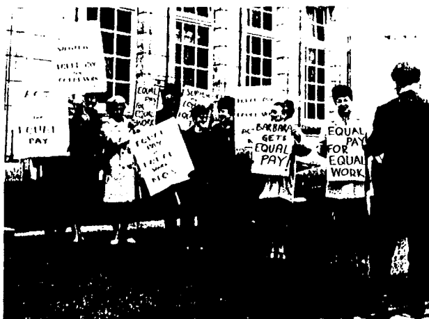
Equal Pay lobby at the Scottish Trades Union Congress.